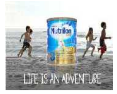
LIVE IS AN ADVENTURE

The advertisement above is one of milk product, Nutrilon Royal. It is taken from its Facebook on July 12, 2017. This advertisement is milk which is specialized for children, it can be seen from the picture. It shows some children who running together.