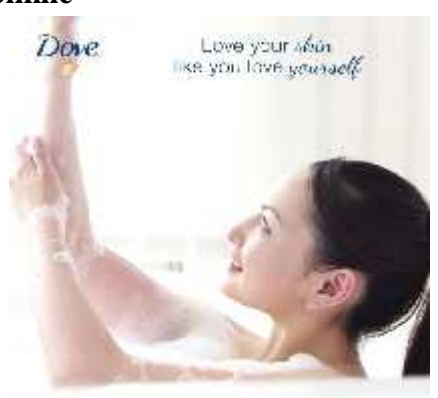
LOVE YOUR SKIN LIKE LOVE YOURSELF

The advertisement above is taken from Dove Facebook on July 12, 2017. Dove has some variants, such as deodorant, soap bar, shampoo and etc. It